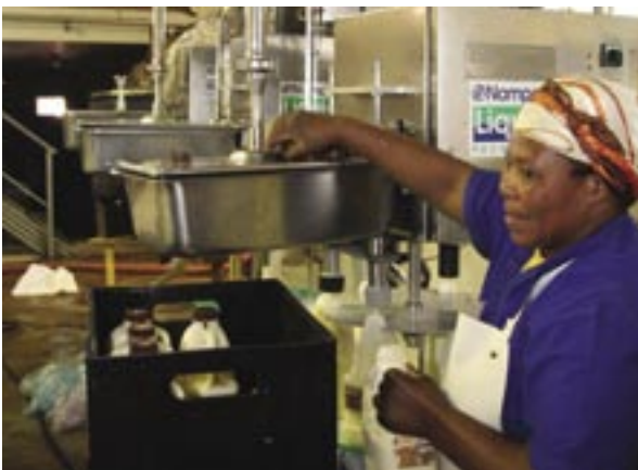
Economic prospects have improved as a result of this award-winning project.